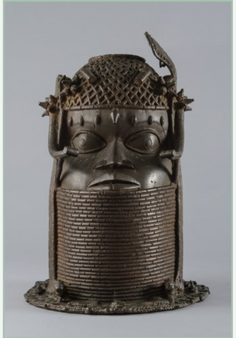
Uhunmwu-elao, lost-wax cast commemorative head of an Oba, used to support a tusk on an ancestral altar. Benin Kingdom, Edo State, Nigeria. 18th-19th century. MAA E 1900.98.2.

To provide context to the Benin Bronzes, it is essential to understand the history of the Benin Kingdom. Dating back to at least 1,200 BCE, this kingdom's territory expanded across modern-day Nigeria, specifically the Edo state. The Benin Kingdom was multicultural and multilingual, eventually forming the Edo people. It was led by an Oba, or king; this period, beginning in the 15th century, saw increased social stratification, building of new palaces, and the solidification of spiritual,