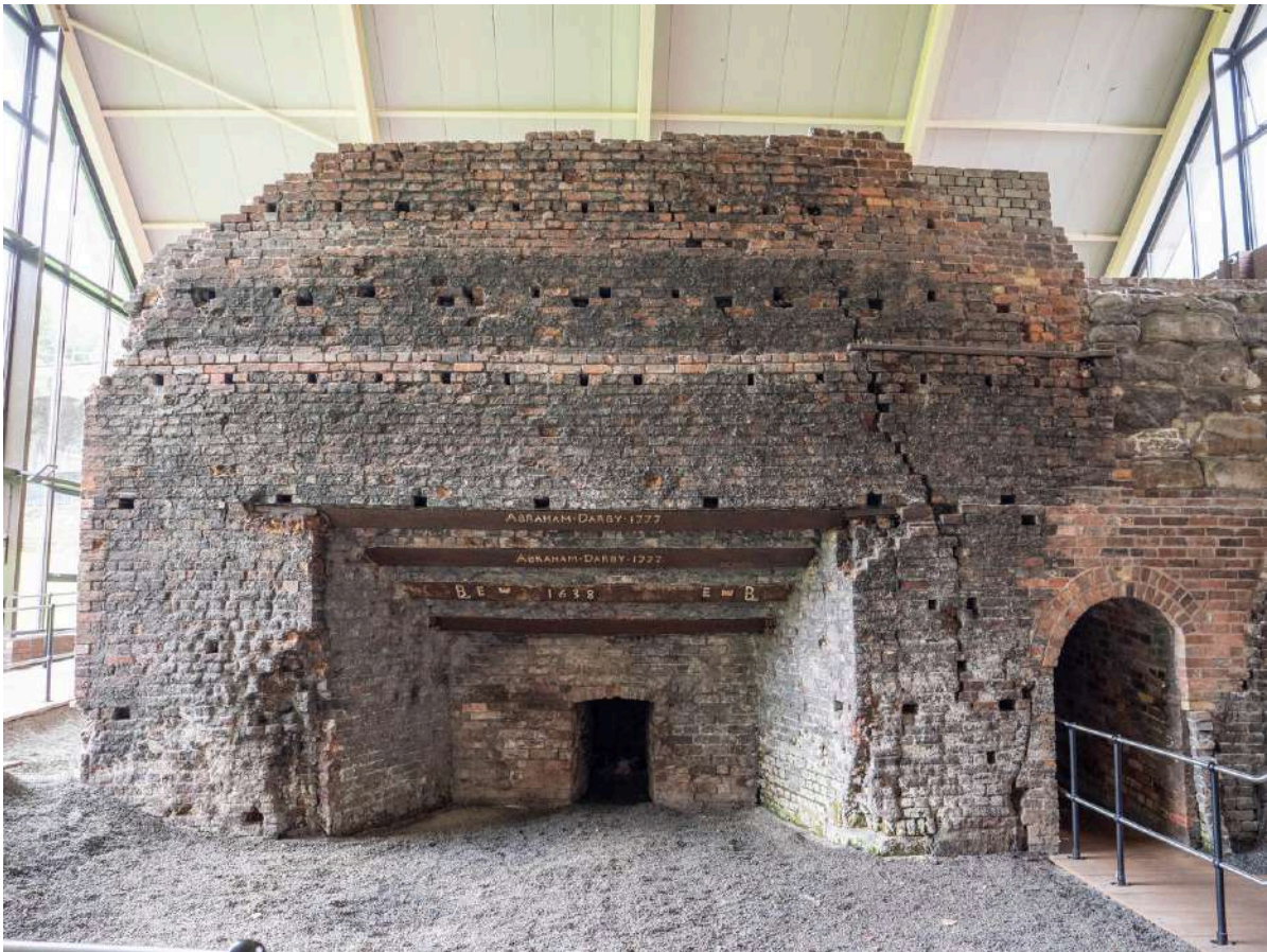
Image: The Old Furnace, Coalbrookdale - Side View.jpg - Wikimedia Commons.

While some industrial heritage sites and museums I've visited have begun to embrace and critically interpret these global links and consequences, these are few and far between. At the time I write this, only the largest and better-funded museums and sites have the capacity for significant re-interpretation [v]. For the majority of smaller industrial heritage museums and sites, those which struggle with funding, maintenance and volunteer recruitment issues, constructing and upholding narratives of 'firsts' and 'bests' remains the most viable branding strategy to get people through the doors.