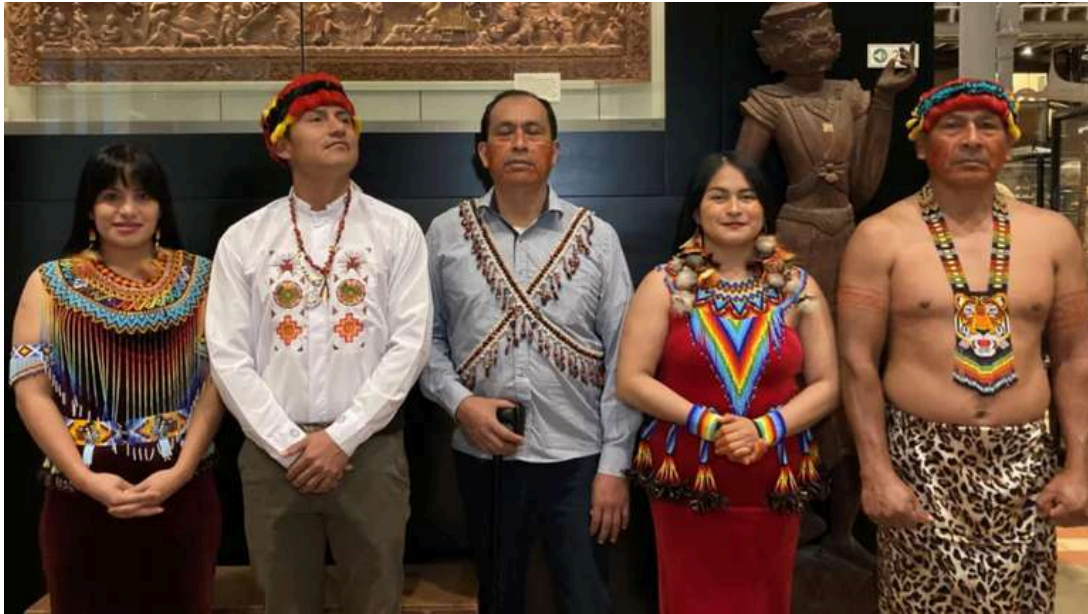
Image: Shuar delegation upon visiting the Pitt-Rivers Museum.

Cultural leaders of an indigenous Ecuadorian community have called for the repatriation of a museum's collection of shrunken heads. The collection of human remains, also known as tsantsas , at the Pitt Rivers Museum in Oxford predominantly came from the Ecuadorian Shuar people, and were acquired between 1884 and 1936.