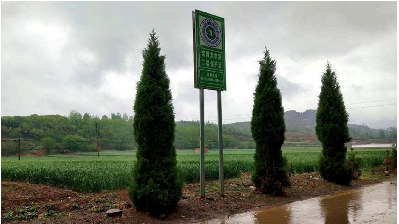
Farmlands in the case study area.

Locals here largely rely on agriculture and other physical labour and struggle to meet their basic physiological needs. They developed their appreciation of heritage over time as branding practices improved their living conditions by providing employment and increasing their incomes, which then allows higher-level needs, such as esteem and belonging, to be met – according to Maslow’s hierarchy of needs (McLeod, 2007).