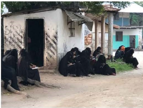
Students from Al Hijra Secondary School.

After lunch I returned to the Pangarithi to find an entire group of children arrayed against the wall quietly sketching away ! Most of the morning group had returned and I suggested they drew what they wanted while I took the 5 newcomers through the preliminary discussions before following a similar course to that of the morning.