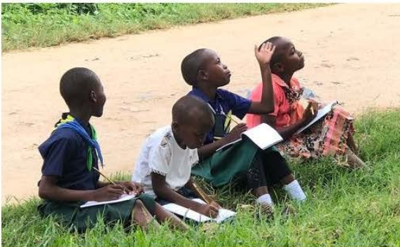
Looking at details and thinking what they tell us.

The aim was to facilitate knowledge exchange, to encourage an appreciation of their built heritage AND to have fun.