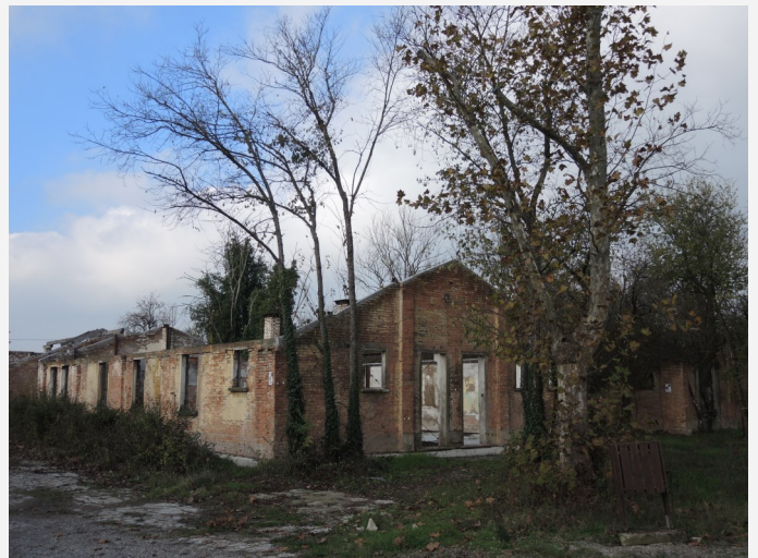
Fossoli Concentration Camp, Italy

More information about the IHRA and the ‘Sites at Risk’ project can be found here: https://holocaustremembrance.com/news-archive/sites-risk-guidelines-best-practice