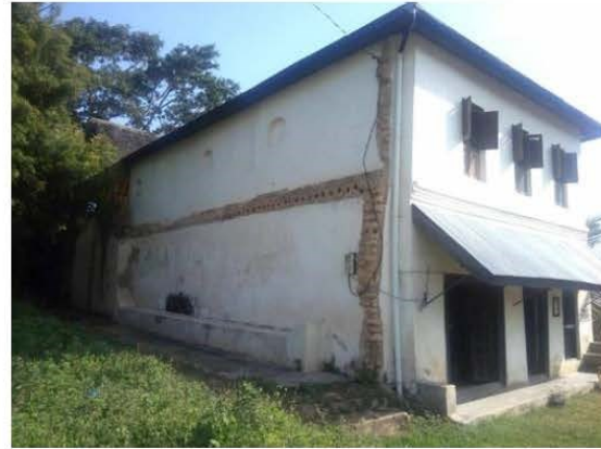
The Cultural Centre east side.

We looked at the side of the building and thought about what the holes in the coral stone, and the wall niches above, might tell us. At the front of the building, I asked them to look at the doors, to tell me about the differences and to think about what this might tell us. Encouraged to look at the details, they then dispersed to sketch what they saw, quiet as mice.